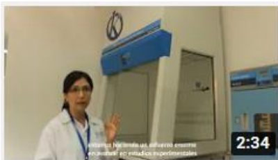
Kalstein France - Jacinto Convit Foundation / Allianc... 23 views • 3 years ago