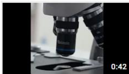
Kalstein's Microscopes 445 views • 1 week ago