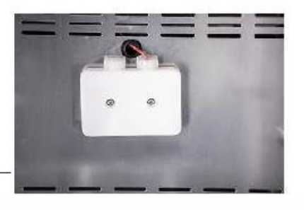
Exclusive patented temperature box design, reveal the real temperature of the blood in storage