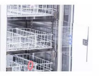
Individual transparent inner door can be opened independently to minimize loss of cold temperature during a door opening

Adjustable shelves, improve space utilization