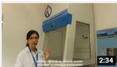
Kalstein France - Jacinto Convit Foundation / Alliances