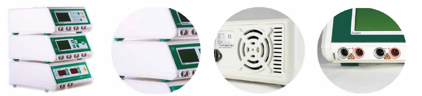
Stackable Chassis Design