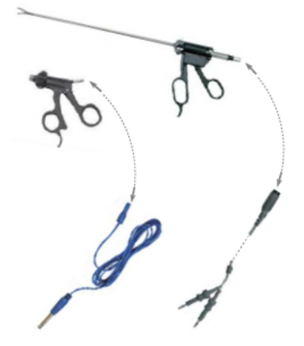
For minimal access application