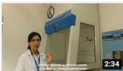
Kalstein France - Jacinto Convit Foundation / Alliances