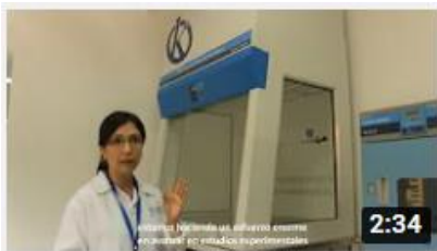
Kalstein France - Jacinto Convit Foundation / Allianc... 23 views • 3 years ago