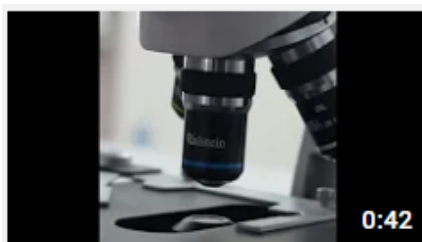
Kalstein's Microscopes 445 views • 1 week ago