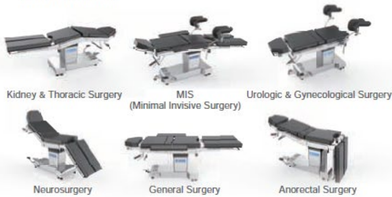
Kidney & Thoracic Surgery

Kalstein's YR02158 model is a versatile operating table, adopting safe & stable hydraulic drive and pneumatic-assisted system, realizing all kinds of surgical positioning required clinically, with simple manual control.