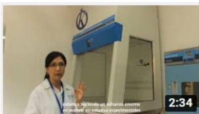
Kalstein France - Jacinto Convit Foundation / Allianc... 23 views • 3 years ago