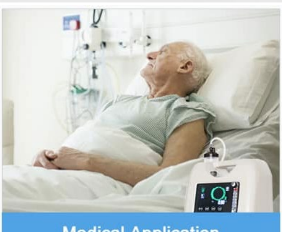
Medical Application It is suitable forclincics and hosrtial