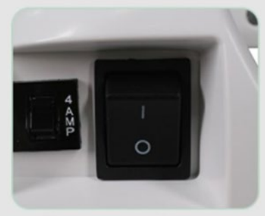
Turn on /off button