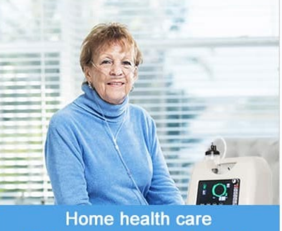
Home health care Plug into wall outlet AC110V/220V Voltage (with AC power cord)