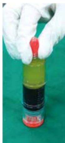
From the bottom to the top: Red blood cell, PRP and plasma