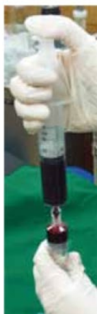
Blood collection Transfer blood to PRP Kit