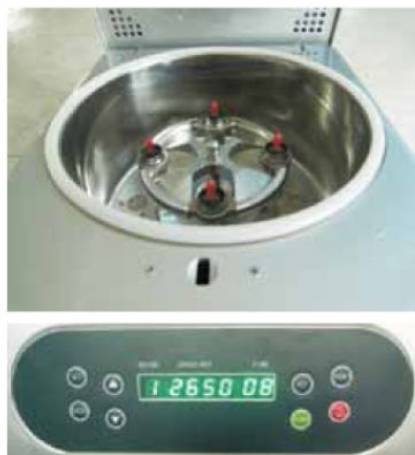
Put PRP kit into the rotor