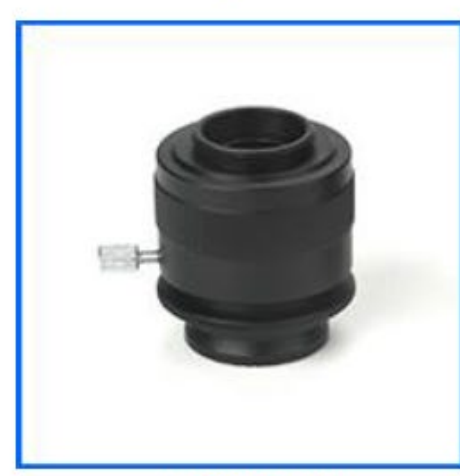
A55.2601-B05 0.5x C-Mount (Focus Adjustable)