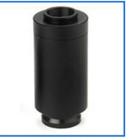
A55.2601-B10 1x C-Mount (Focus Adjustable)