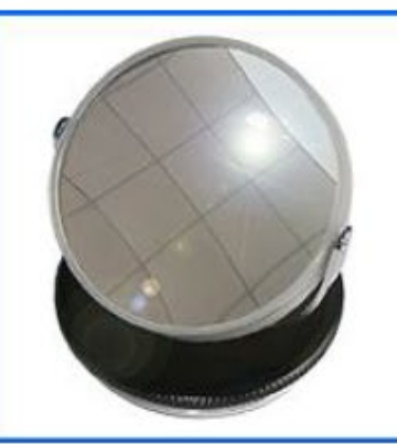
A56.2601-B Plano-concave Mirror