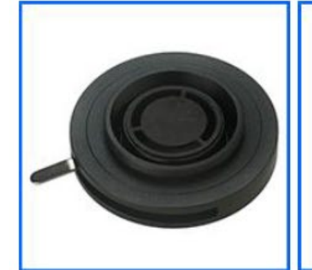
A5D.2611-B Dark Field Ring