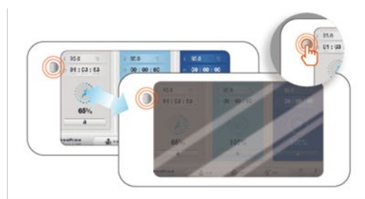
Low power consumption mode and one-touch screensaver for safety and energy saving