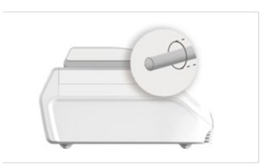
Reserve mechanical lid opening function to ensure safe opening of hot lid in case of accident

Innovative design of block is easy for change. The process takes typically less than 10 seconds and requires no tools or kits.