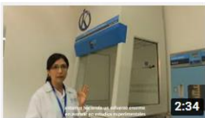
Kalstein France - Jacinto Convit Foundation / Allianc... 23 views • 3 years ago