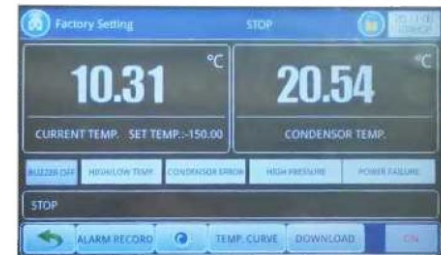
LCD Touch Screen

This product is specially designed and manufactured for long term storage of various biological product, including viruses, germs, erythrocytes, leucocyte and cutis. Applications can be found in blood banks, hospitals, epidemic prevention services, and research institutes, laboratories in electronic and chemical plants, bio-logical engineering institutes and marine fishery companies.